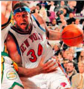
DON'T TEST, DON'T TELL. Curry refused to undergo screening that might have revealed HCM, so the Bulls traded him to New York.