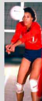
FLO HYMAN, died in 1986 at age 31 (Marfan syndrome)

Hypertrophic cardiomyopathy is commonly assumed to have killed Hank Gathers, the 6' 7" Loyola Marymount forward, and Reggie Lewis, the Boston Celtics' star swingman. But their deaths—as well as those of several other prominent athletes—were caused by different kinds of heart failure.