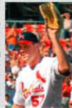
GEORGE BOIARDI, died in 2004 at age 22 (possible commotio cordis)

The St. Louis Cardinals' pitcher was found dead in a Chicago hotel room, atherosclerosis having impeded the blood supply to the heart.